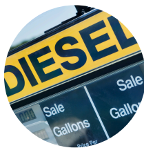
COMDATA Fuel Card