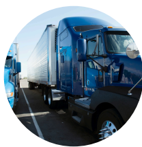
Hotels 4 Truckers™ Hotels4truckers.com