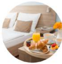
Hotel Discount: up to 60% off