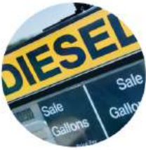
Coming Soon! COMDATA Fuel Card