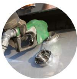
ZERO-FEE Fuel Card