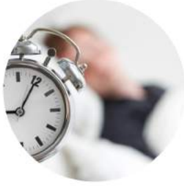
Sleep Apnea Testing