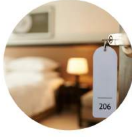
Hotel Discount: up to 60% off

NAIT has long-term partnerships with providers that share its dedication to the industry. We have worked with our members to develop association benefits to meet their needs.