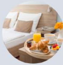
Hotel Discount: up to 60% off