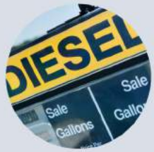
ZERO-FEE Fuel Card